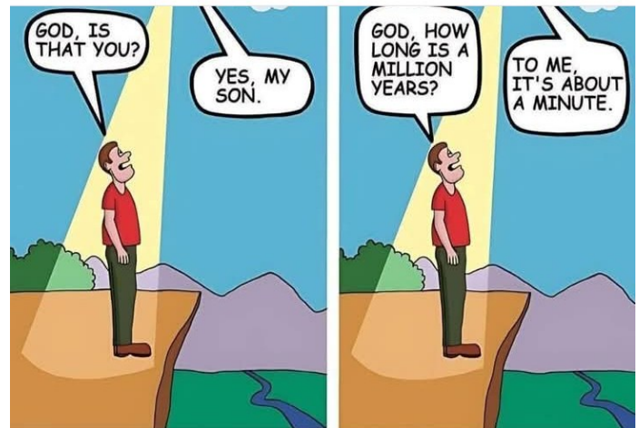
The Grog on facebook/GrogComics

We are going to continue with game Sundays every fourth Sunday of the month. Our next one will be Sunday, June 22 from 3:00pm-5.